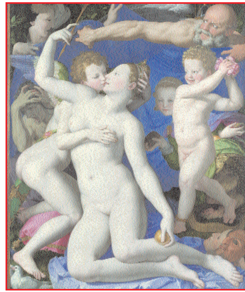
LET IT ALL HANG OUT: Bronzino's An Allegory with Venus and Cupid from 1540, National Gallery

If it's just a treat you need (eat in or takeaway to surprise someone at their desk at work), try Maison Bertaux for delightful decor, hot chocolate/coffee and exquisite cakes. Maison Bertaux, 28 Greek Street, between Shaftesbury Road and Old Compton Road, Soho. Call 020 7437 6007.