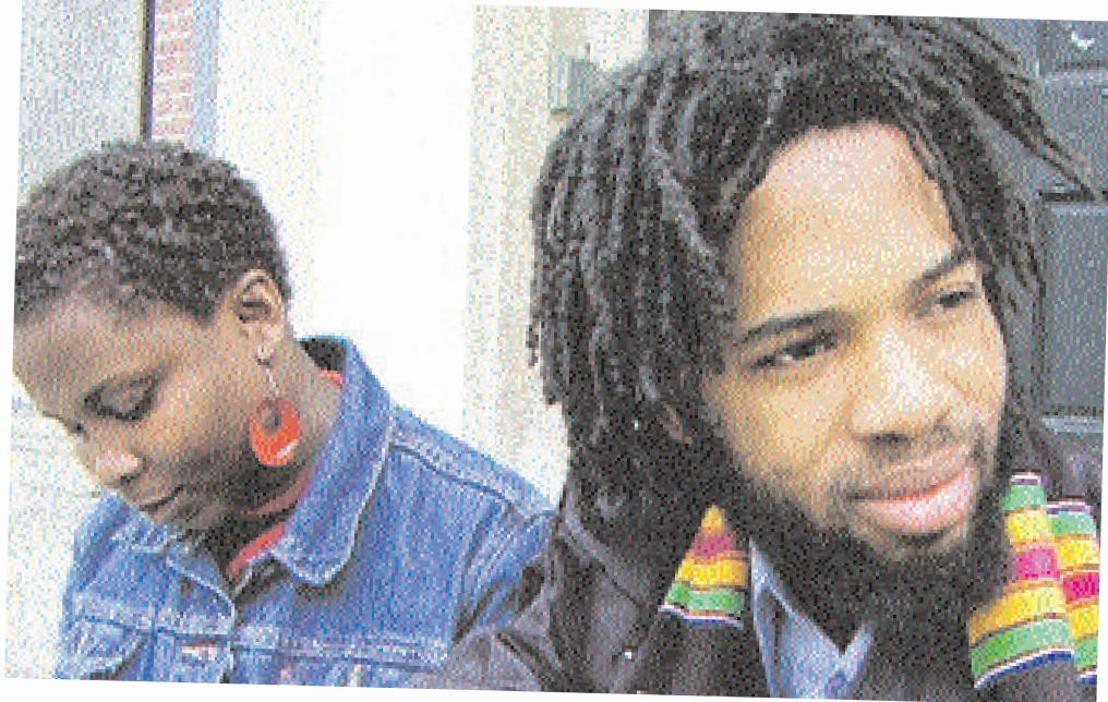
LIFE STORY: Zoned In is at The Flea Pit

● Zoned In screens at The Flea Pit, 49 Columbia Road/Bia Road, E2, on Wednesday, November 19, at 8pm. £5. Call 020 7033 9986. See www.thefleapit.com