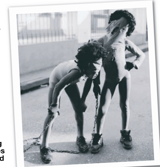
LANSE KOD: (Left) Carrying the ropes that used to bind the Haitian people as slaves. The slaves' revolt was 1791-1804