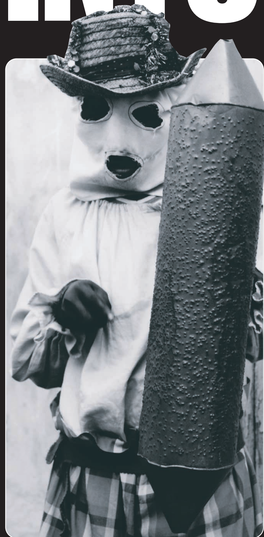
BANN RARA: A member of a Rara band, who go round the carnival playing haunting music by riffing on one-note cornets