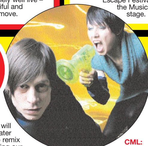
EUGENE MACHINE: How did you become involved with The What? ES: The What? asked us to play after seeing us last year in west London. We were over the moon!